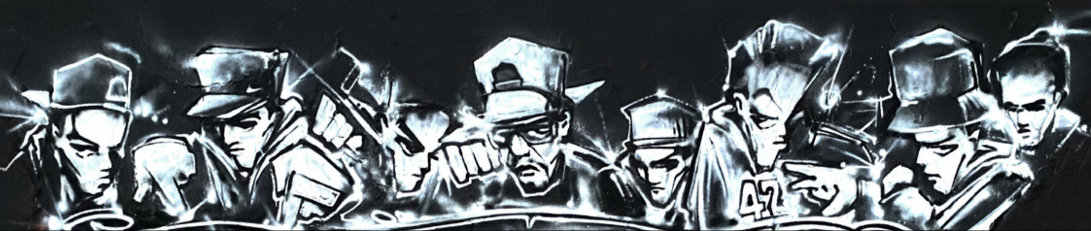
Oldschool – Hip Hop Flyer